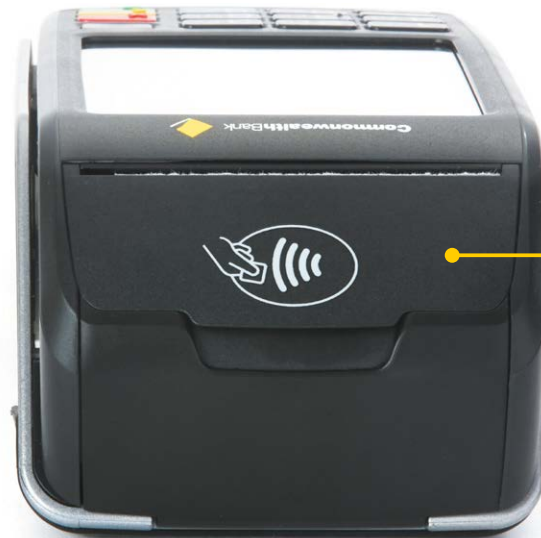
Printer Compartment Lid