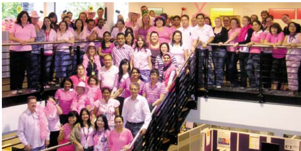
STAFF AT THE COMMONWEALTH BANK'S OPERATIONS PROCESSING CENTRE IN LIDCOMBE SHOW THEIR SUPPORT AT A PINK-THEMED EVENT TO RAISE AWARENESS AND FUNDS FOR THE BREAST CANCER INSTITUTE OF AUSTRALIA.

Our continued focus on designing innovative and market-leading products to satisfy our customers' needs, combined with our commitment to customer service, led to continued improvement in retail customer satisfaction results. Based on Roy Morgan data for December 2009, the Group improved for the fifth consecutive