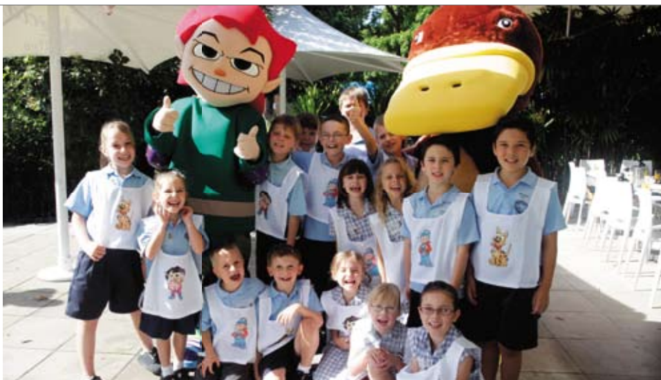
STUDENTS FROM BLACKWELL PUBLIC SCHOOL PICTURED WITH PLATY AND SPEN, THE DOLLARMITES CHARACTERS.

We have also announced our commitment to improving the financial literacy of more than one million students in Australia over the next five years. This ambitious target will be supported with an investment of $40 million.